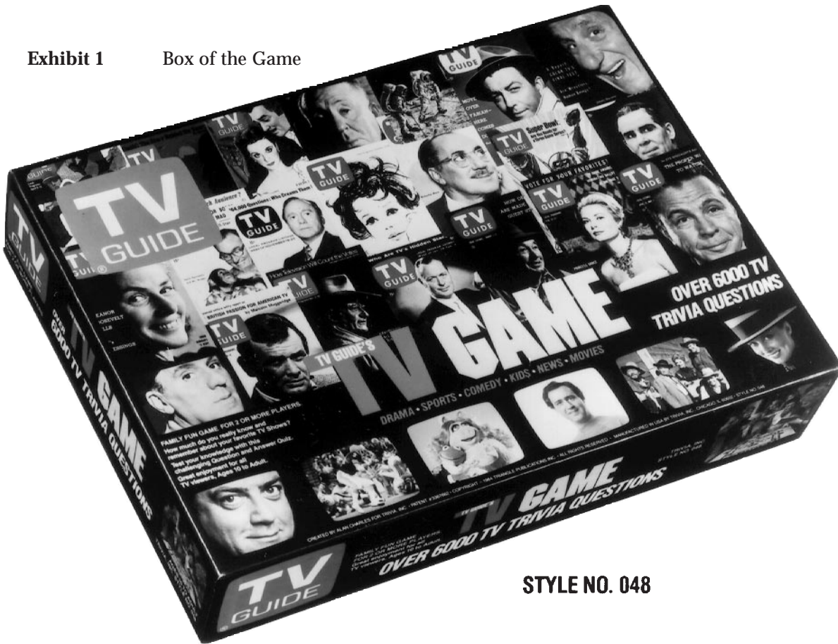
Exhibit 1 Box of the Game