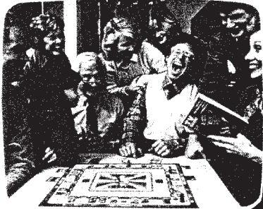
Exhibit 6 Ads in TV Guide magazine

Party Fun For Everyone... 2 to 20 Players!