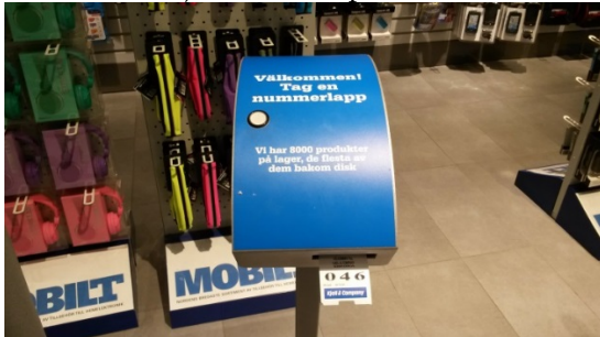
1) Ticket dispenser