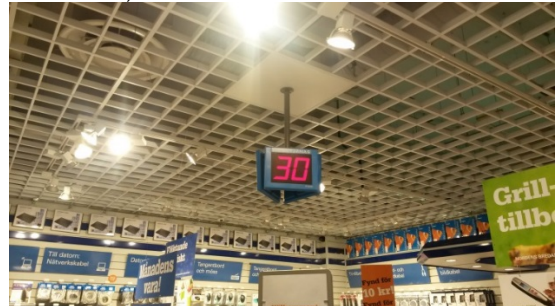
2) Ticket-number indicator